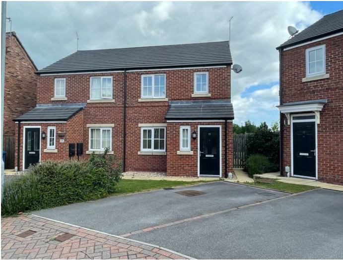
Front External - Parking